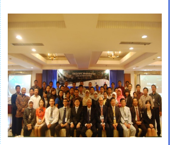
Regional Anti-trust Workshop with the KPPU on March 24<sup>th</sup> ~26<sup>th</sup> in Bogor, Indonesia

<u>Regional Anti-trust Workshop with the KPPU on</u> <u>March 24<sup>th</sup> ~26<sup>th</sup> in Bogor, Indonesia</u>