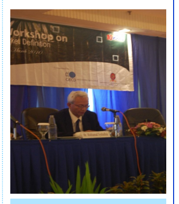
Regional Anti-trust Workshop with the KPPU on March 24<sup>th</sup> ~26<sup>th</sup> in Bogor, Indonesia