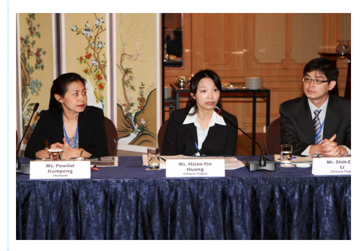
Cartel Enforcement Case in Chinese Taipei <<u>By Hsiao-Yin Huang></u>

The presentation by Chinese Taipei at the recent OECD -KPC cartels event included three parts. The first part focuses on the definition of concerted action and the question of price leadership in an oligopoly market. Concerted action is regulated in Article 7, 14 to 17, 35 and 41 of the Fair Trade Act (Act). In principle, any concerted action is not allowed, unless it is one of the 7 situations expressly permitted, such as import or export joint ventures, standard production, and alliances between small businesses. The significant question whether the action of the firm's price leadership in an oligopoly market is concerted action or not is worth to mention. Nowadays, because it is difficult to get a direct evidence of a cartel agreement, circumstantial evidence can play an important role in proving a cartel agreement.